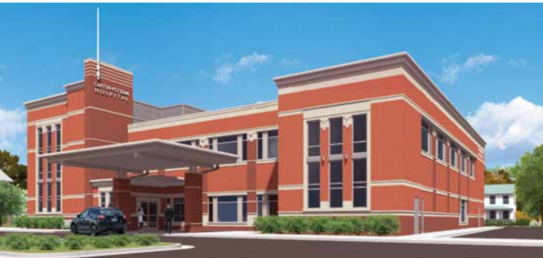
Canton-Potsdam Hospital's new outpatient procedure building, shown here in an artist's rendering.

Canton-Potsdam Hospital received formal approval from the New York State Department of Health to build a two-story outpatient procedure building on the hospital's main campus at 50 Leroy Street in Potsdam.